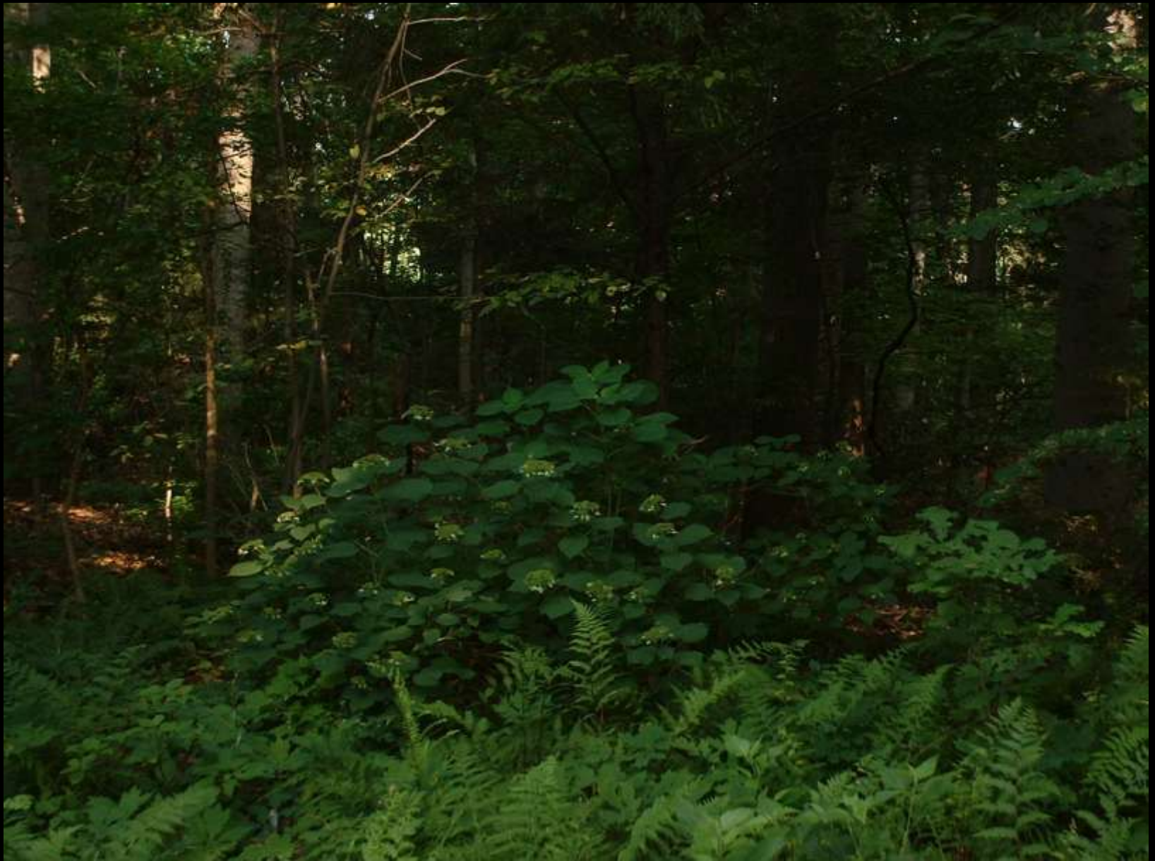
Woodland in North Carolina