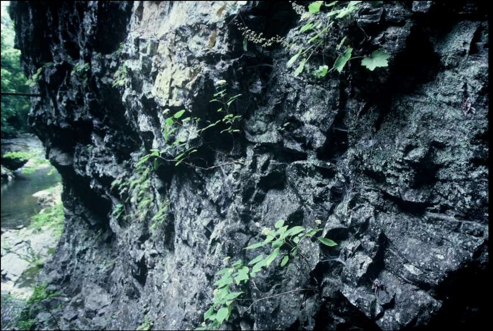
Hydrangea arborescens in Georgia