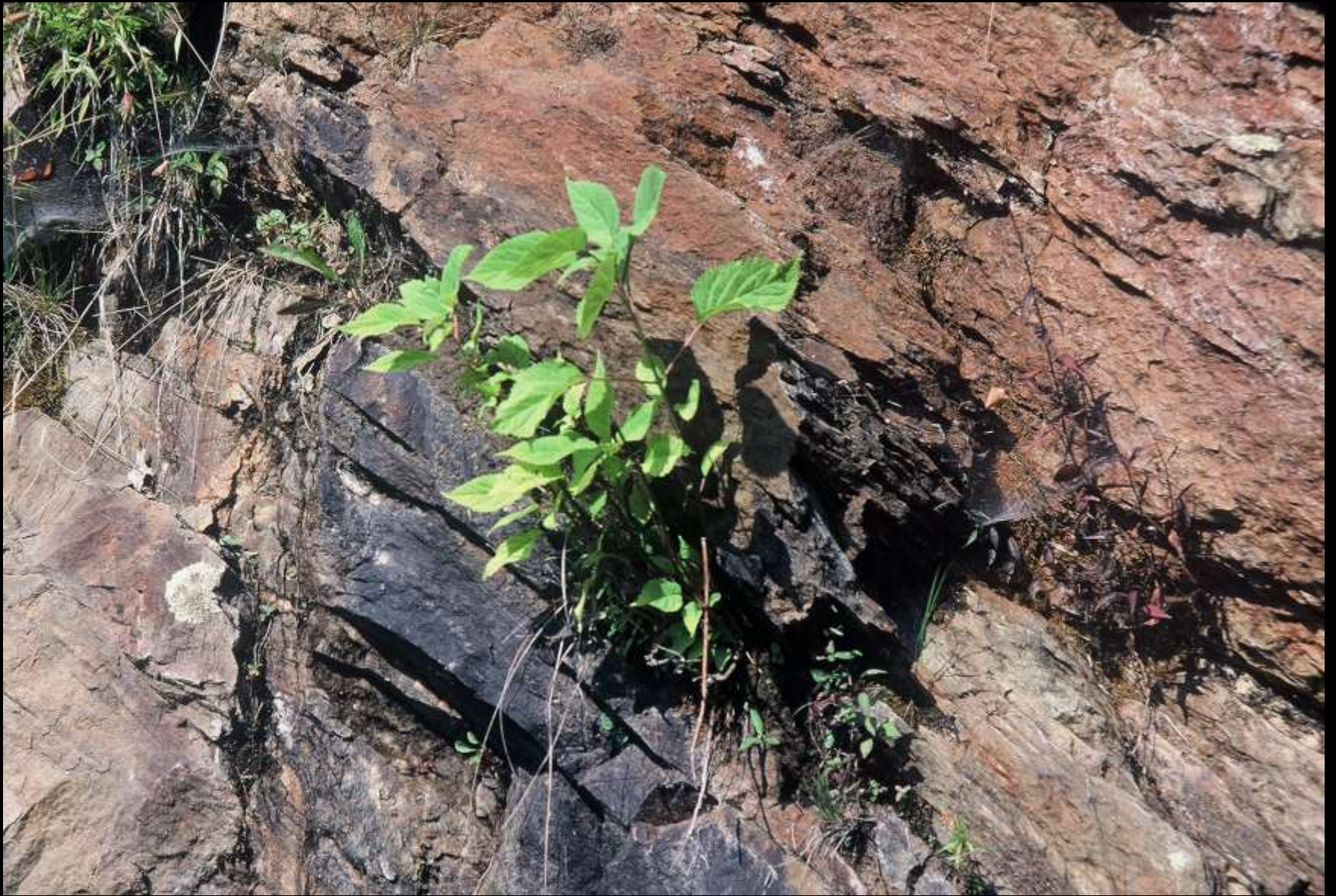
About 5,000 feet on Blue Ridge Parkway